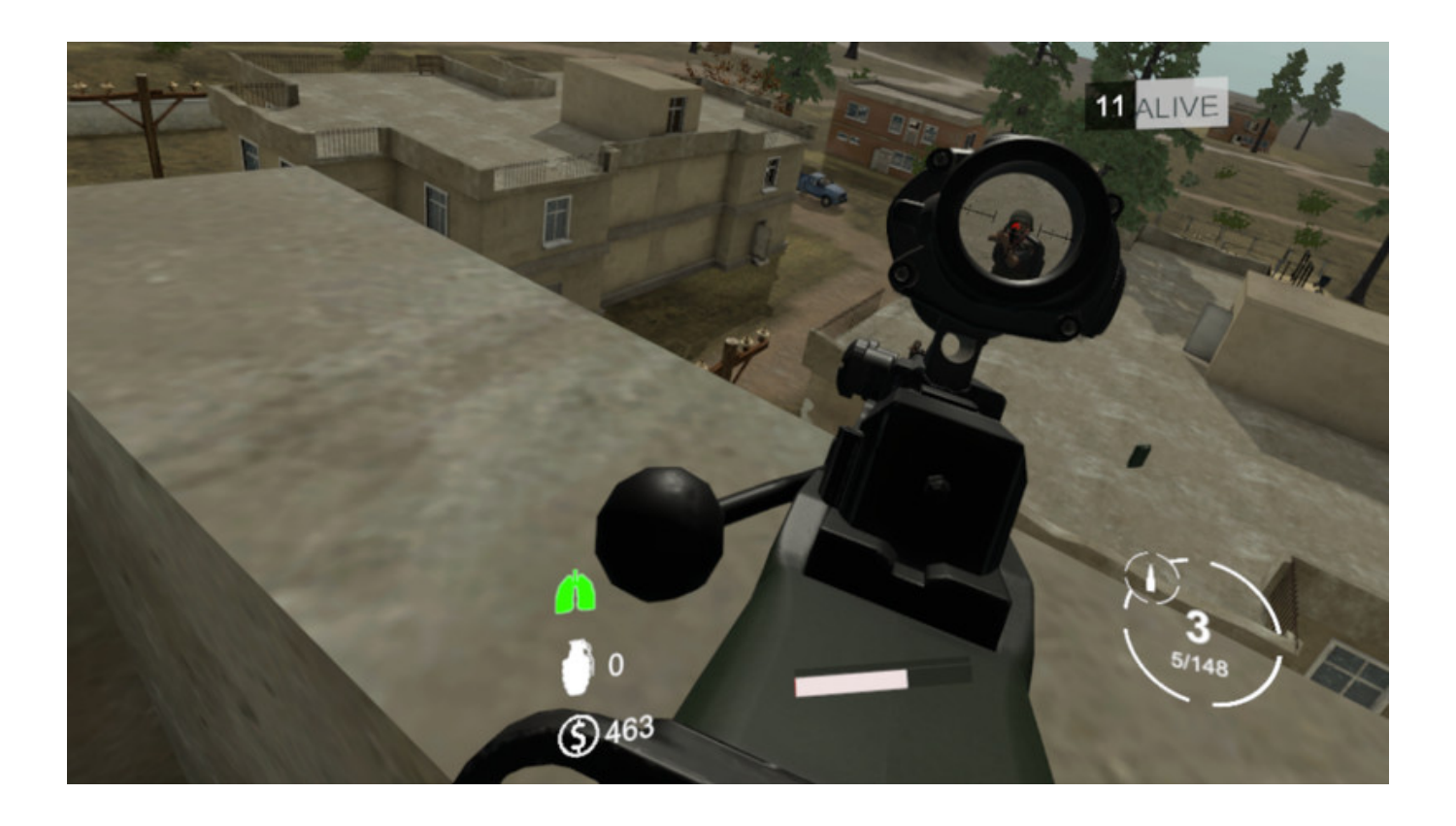
The Angry Banana Download Thepcgames

Download ->>->> <a href="http://bit.ly/2JiDUql">http://bit.ly/2JiDUql</a>